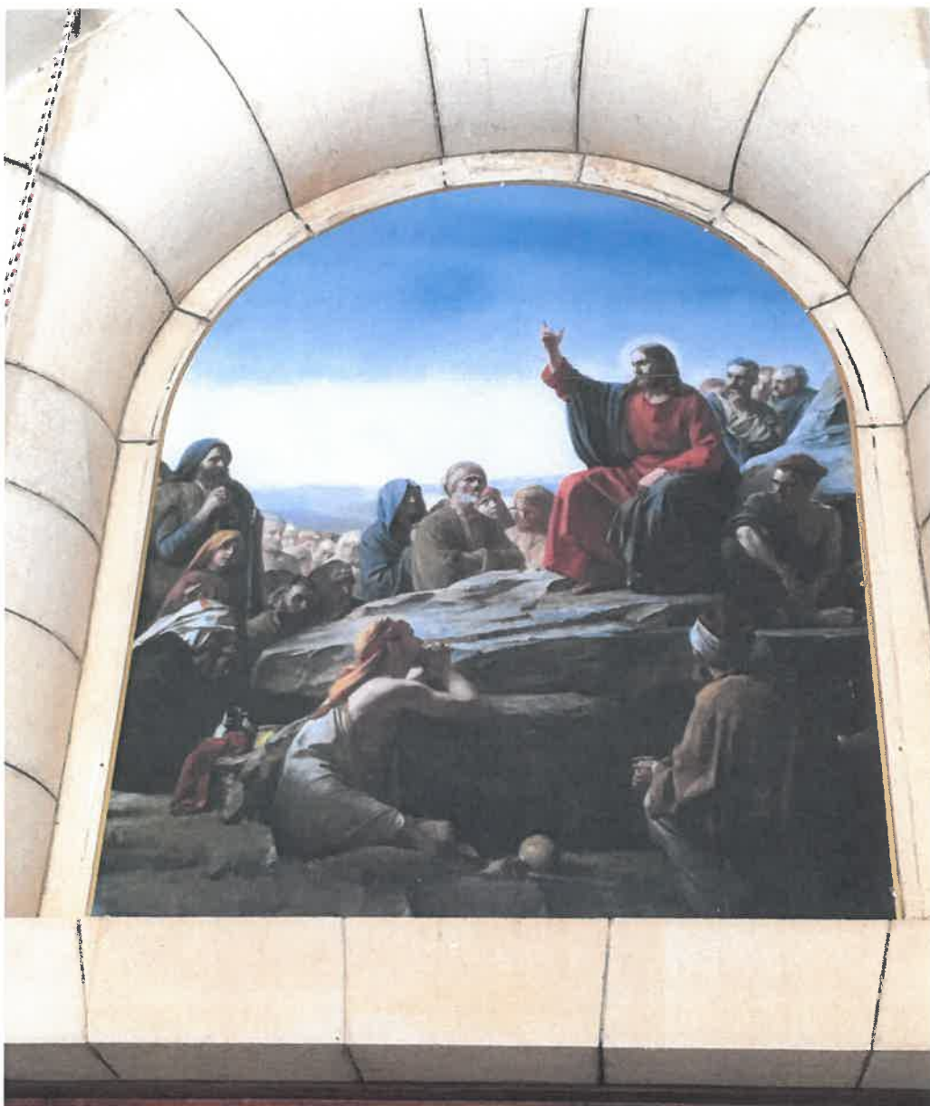
A picture depicting the scene where Jesus delivered the Beatitudes