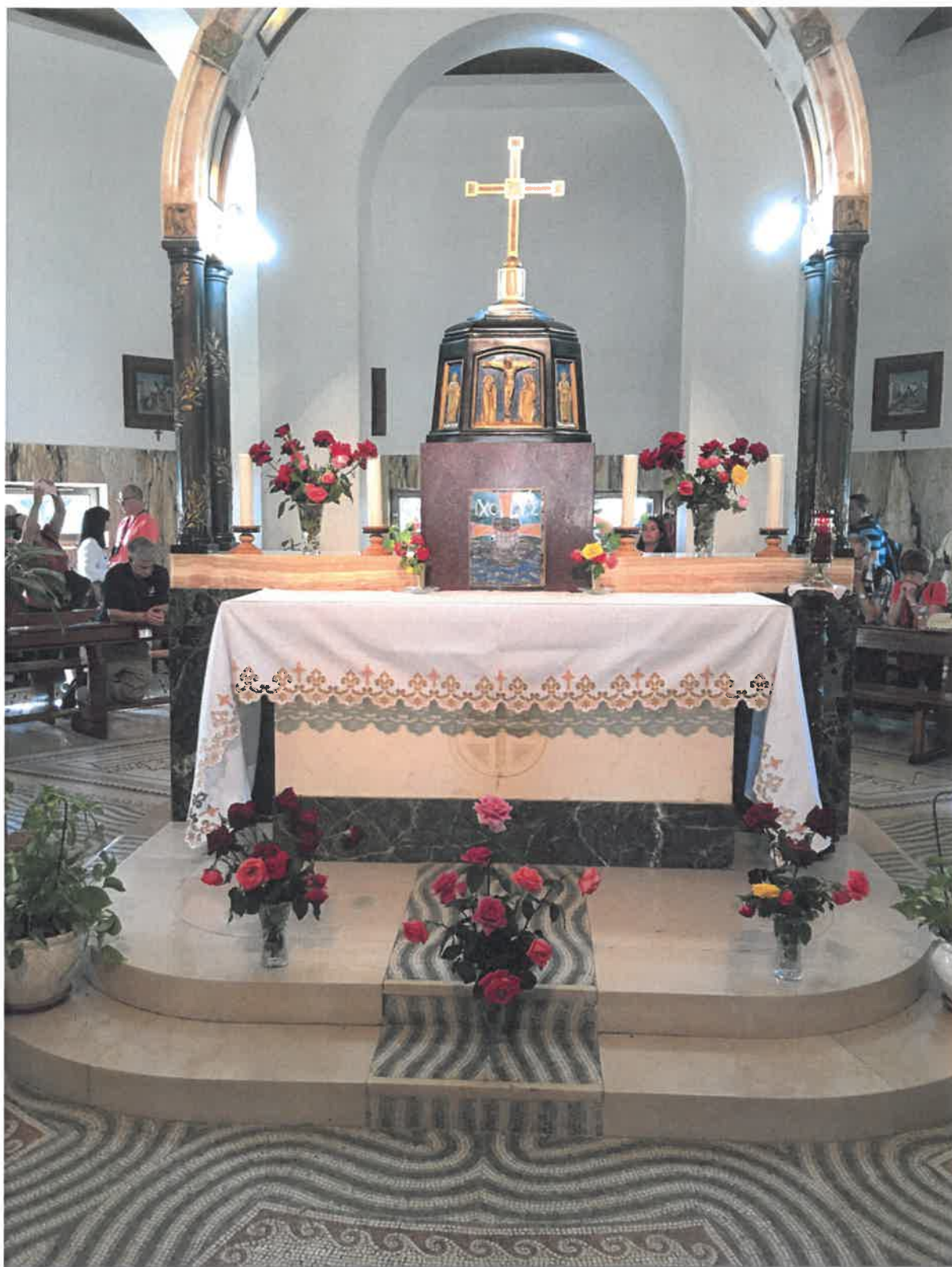
Inside the Church of the Beatitudes