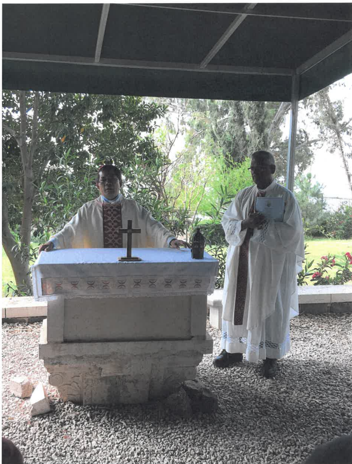
Celebrating mass at the Altar of Saint Matthew