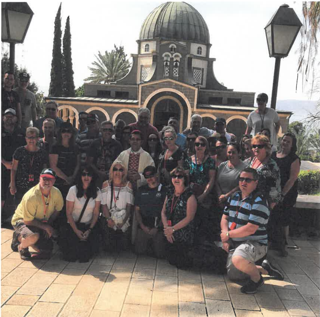
CEO staff at the Church of the Beatitudes

The term beatitude comes from the Latin noun beātītūdō , which means "happiness" and is an appropriate reading to reinforce our gratitude to God. Each Beatitude echoes the ideals of the teachings of Jesus on mercy, spirituality, and compassion.